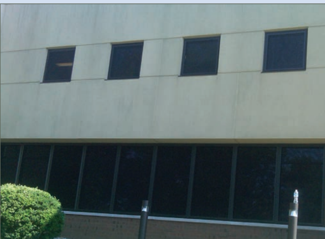
After - Protected