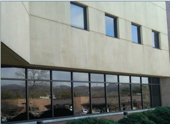
Before - Unprotected

Security without sacrificing architectural building design. The low profile screen frame fits building contours and only has the appearance of a heavy bug screen.