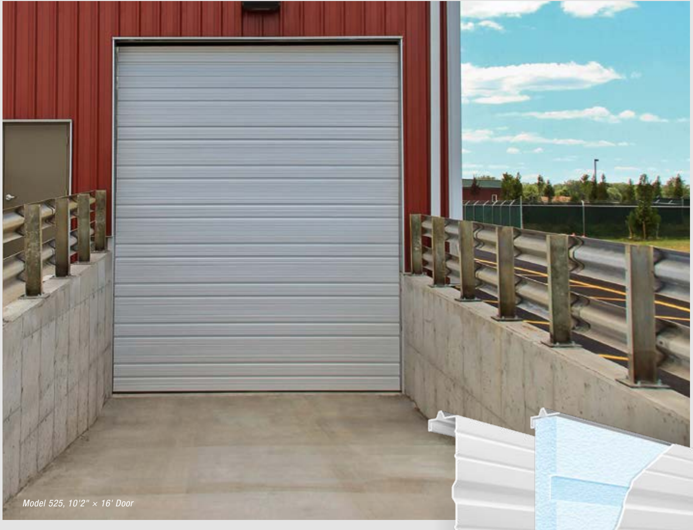
Model 525, 10'2" x 16' Door