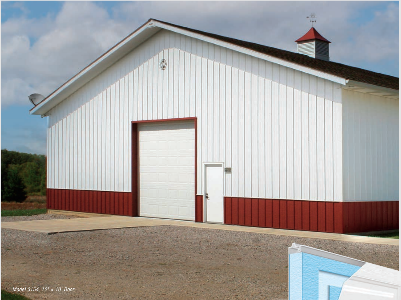
Model 3154, 12' x 10' Door