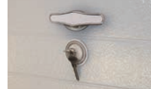
Outside keyed lock