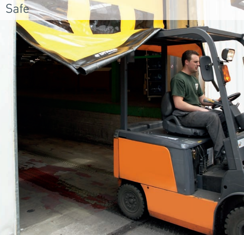
“PUSH-PULL” Drive Technology